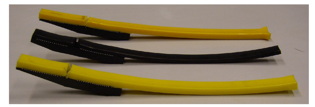
Figure 1. Strips (20 mm wide) for the Slow Peel Test.